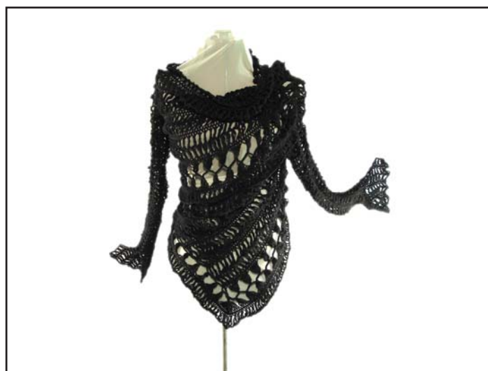
Photo: Our Hairpin Lace Cardi-Wrap

Did you like this free pattern? Experience the same great level of instruction and get more experience with the fun and easy hairpin lace technique. Our Convertible Wrap is a great introduction project for our other great hairpin lace pattern: Our Hairpin Lace Cardi-Wrap. Part shawl, part cardigan, our Cardi-Wrap will surely become a much-loved wardrobe staple.